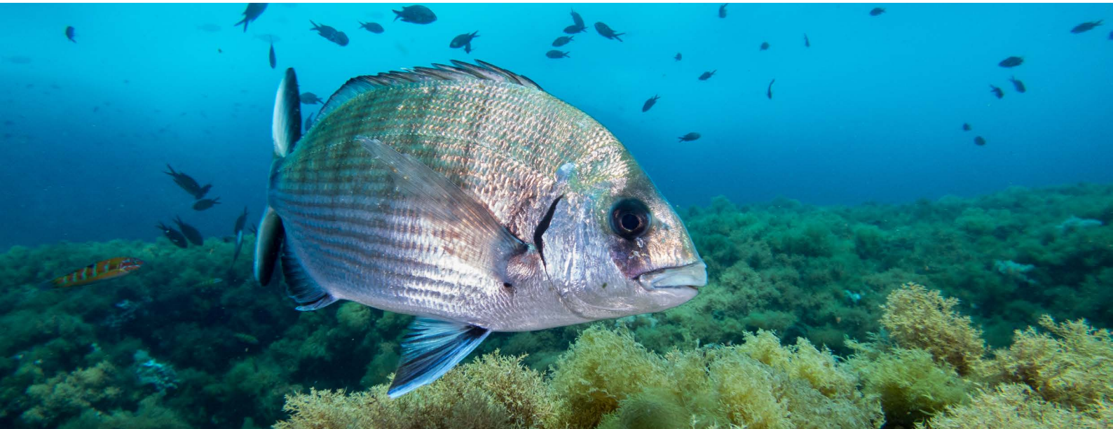
White Sea Bream ( Diplodus sargus ).