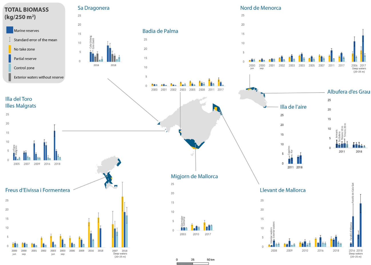
Figure 1. Map of the Balearic Islands showing the location of the marine reserves where the total fish biomass is studied. All are marine reserves of fishing interest, with the exception of D'es Grau Natural Park Reserve. The vertical scale allows the comparison between reserves.